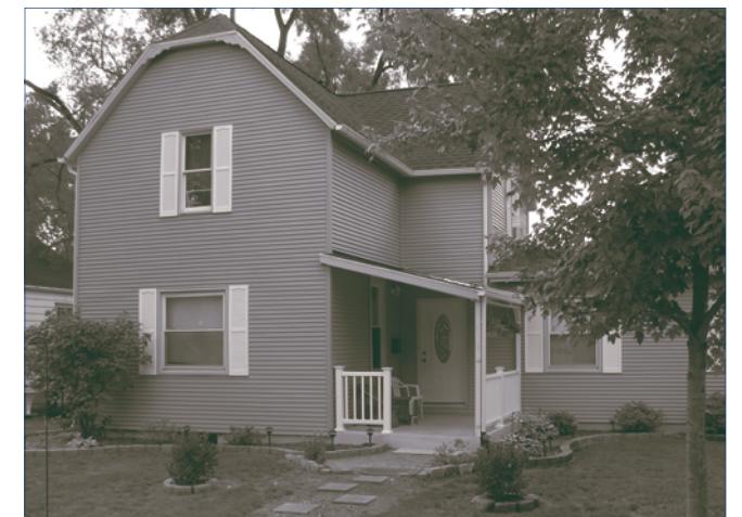
Home sweet home. Serenity House Phase II offers hope and sobriety.