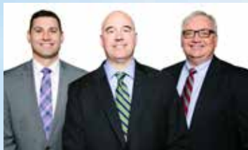
Alderfer Bergen & Co. celebrated their 20th Anniversary in 2020.

The following donors chose to honor someone important in their lives by making a gift in their name. Often these gifts mark a special occasion like a birthday, anniversary or retirement.