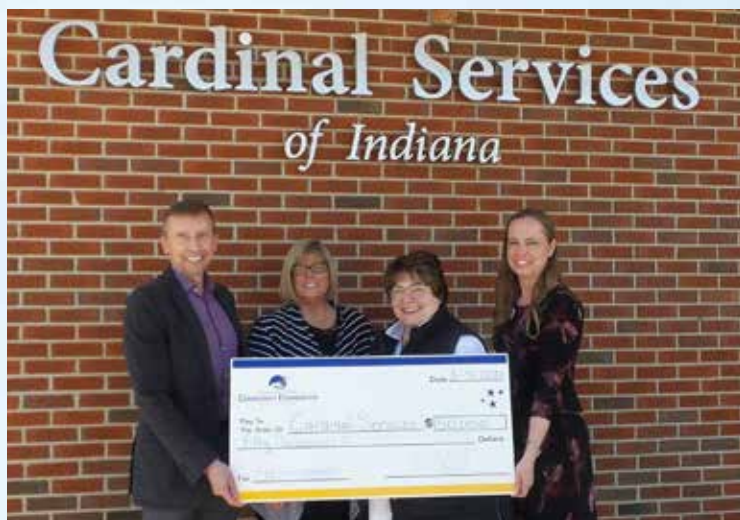
The Community Foundation's Board of Directors presented a $50,000 proactive grant to Cardinal Services for their Ability campaign to renovate a former grocery store into an Ability Center to serve people with disabilities.

Kosciusko County Patriotism Endowment Kosciusko County Riley Kids Fund Sarah Krizmanich Memorial Fund Lake Wawasee Community Fund *LaunchPad Coalition Fund *LaunchPad Initiative Fund Vivian B. Light Bicycle Safety Education Fund Mary Louise Lowe Charitable Fund Greg Sasso Memorial Fund Syracuse Community Childcare Fund The Syracuse/Wawasee Community Fund *Tracey's Trails Fund *Turtle Toes Fund *Vast Difference Fund The Way Maker Endowment The Virgil E. Wise and Jewel A. Wise Fund for Children Women's Fund *Women's Health Fund Youth Recruitment & Retention Hunting, Fishing, Trapping, and Shooting Sports Education Fund